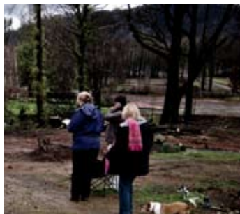
On site at Marysville

Visionary Design Development Pty Ltd continue to be involved in Victoria's Bushfire Reconstruction efforts, on behalf of Archicentre and independently. VDD has prepared designs for projects located in Pheasant Creek, Flowerdale, Kinglake and Marysville. Sustainability, accessibility and affordability are recurrent design themes.